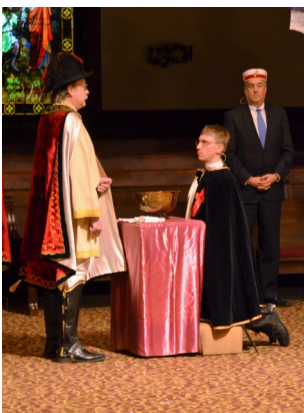
32nd Degree during Spring Reunion

so, come and see it during the Fall Class. Have you always wanted to have a part in a degree? Contact me or the Valley Secretary, and we will get your name and contact information to the Degree Directors. Many times, you just need to ask about a part. The Directors are always looking for more and new actors for the degrees. Not an actor,