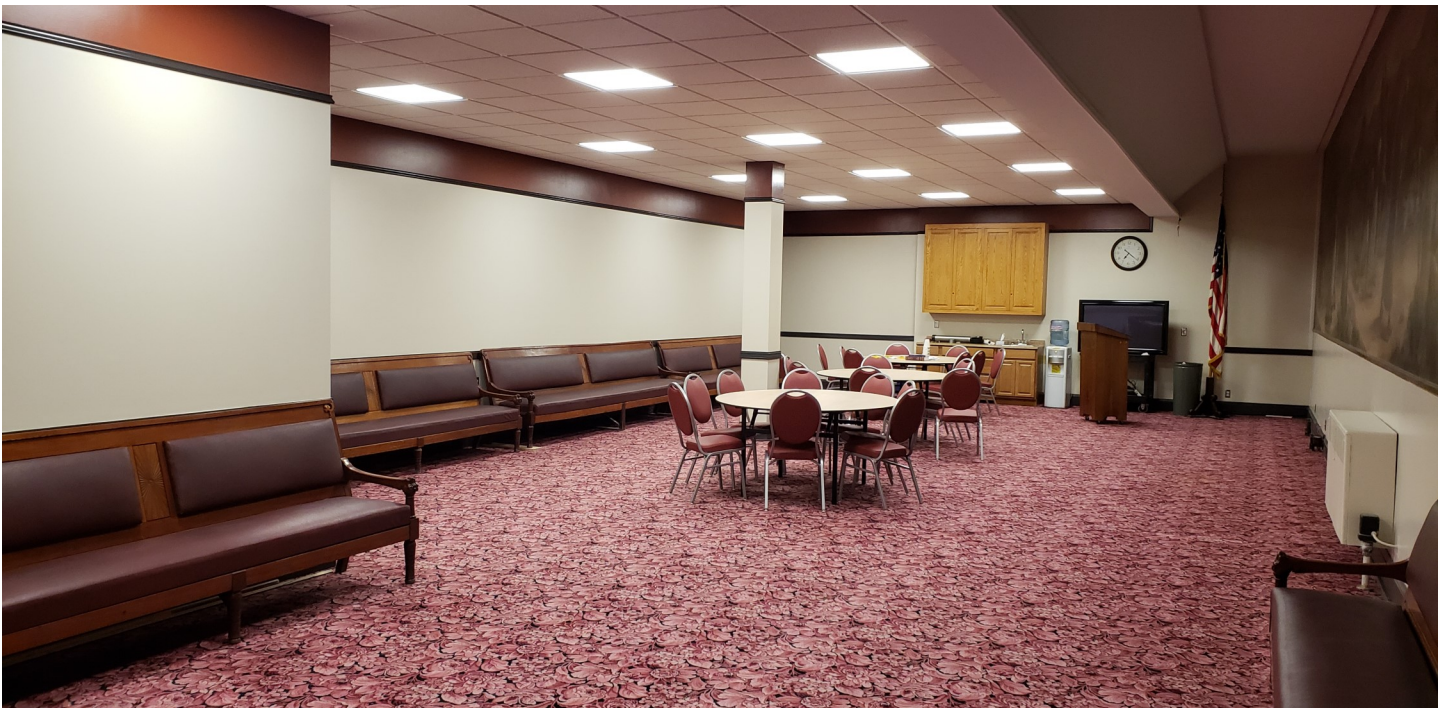
The classroom was modified to include a second conference room and a storage closet.