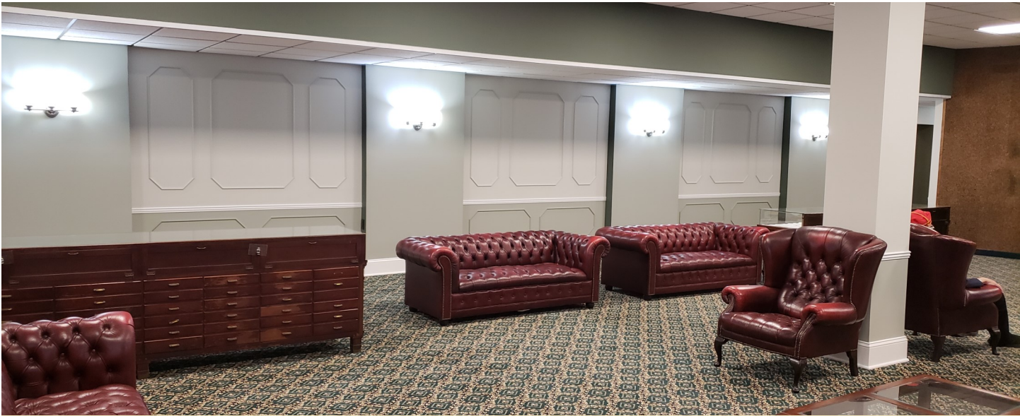
A cleaner, updated look was given to the upper lounge.