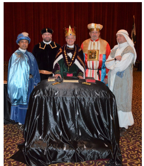
Fall 2019 10th Degree Adopted by Lake Harriet #277.

Each Thursday, the Fall class and all Scottish Rite brethren in attendance are learning and exploring concepts to help them in their journey toward Masonic light. I encourage you to join your Brothers of the Rite as the degrees continue each week. Come for one week or more and explore and enjoy the